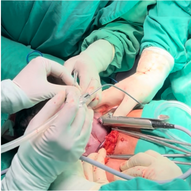
Fig. 2. Tracheal intubation of the partially delivered foetus was performed under direct laryngoscopy during the ex-utero intrapartum treatment procedure while maintaining placental support.

A bolus of intravenous phenylephrine 100 mcg was given once, followed by infusion at 0.03–0.04 mcg/kg/min to maintain maternal systolic BP of 100–120 mmHg. Nitroglycerin 0.5–0.6 mcg/kg/min infusion was started pre-uterine incision to achieve uterine relaxation. The skin incision to uterotomy required 10 minutes. At the time of uterine incision, the obstetrician confirmed that the uterus was fully relaxed. During EXIT, once the foetal head and shoulder were delivered, tracheal intubation was performed under direct laryngoscopy with a Parsons 8.0-cm laryngoscope using a 3.5 mm endotracheal tube preloaded on a 2.7-mm telescope, and the tube was anchored at 9 cm (Fig. 2). The position and placement of the tracheal tube were confirmed under direct laryngoscopy. Once the foetal airway was secured, the umbilical cord was clamped and cut. Time from uterine incision to cord clamp was 5 minutes. After delivery of the foetus, the infusion of nitroglycerin and phenylephrine was stopped. A bolus of intravenous oxytocin 5 units was given, followed by an infusion of 20 units/L. Epidural morphine 3 mg was administered for postoperative analgesia. Total fluid given intra-operatively was 1200 ml, with an estimated blood loss of 300 ml. The total time elapsed from starting the anaesthetic procedure to the end of the operation was 79 minutes. The neonate was transferred to the neonatal intensive care unit for mechanical ventilation and was successfully extubated on day 2 of life.